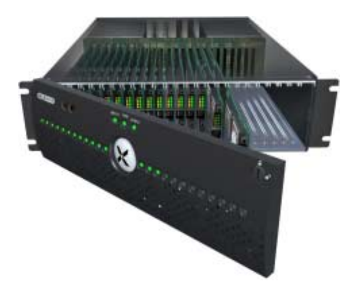
Figure 2. The RLX System 324

The rest of the paper is organized as follows. In Section 2, we discuss the architecture and technology behind our Bladed Beowulf. Next, Section 3 presents the performance evaluation of our Bladed Beowulf via a gravitational microkernel benchmark, an N-body parallel simulation, NAS parallel benchmarks, and a treecode benchmark. With these performance numbers in hand, we then propose a new performance metric for the high-performance computing community — <u>Total Price-Performance Ratio</u> (ToPPeR), where Total Price encompasses the total cost of ownership — and discuss two related metrics, namely performance-space ratio and performance-power ratio.